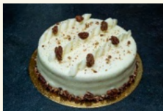
CARROT CAKE 9" $24.75 (each)