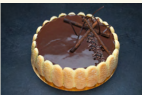
TIRAMISU 9" $28.00 (each)