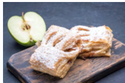
APPLE STRUDEL $16.20 (dozen)