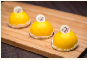
MANGO MOUSSE BOMB $3.69 (each)