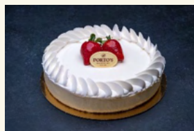
NEW YORK CHEESECAKE 9" $23.00 (each)