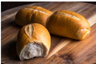
CUBAN BOLILLO ROLL $1.80 (Pack of 6) $7.50 (Pack of 25)