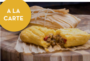
PORK TAMALES $2.50 (a la carte)