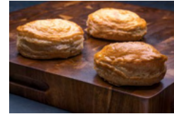
MEAT PIE (PASTEL DE CARNE) $13.35 (dozen)