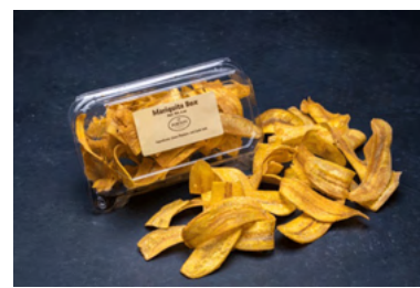
MARQUITAS (PLANTAIN CHIPS) $3.10 (each)