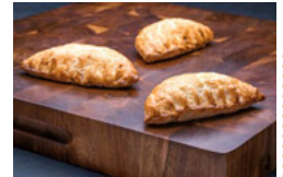
CHICKEN EMPANADA $14.65 (dozen)