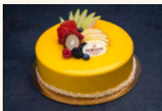
MANGO MOUSSE CAKE 9" $27.00 (each)