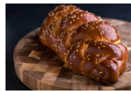
EGG BREADS (CHALLAH) LARGE $3.15 (each)