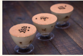
TIRAMISU CUP $3.79 (each)