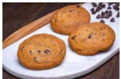
CHOCOLATE CHIP COOKIE $8.55 (dozen)