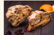
CRANBERRY ORANGE SCONE $2.05 (each)