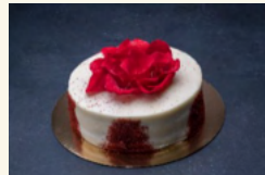
RED VELVET CAKE 9" $28.00 (each)