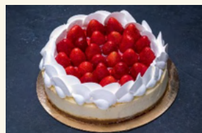
FRESH STRAWBERRY CHEESECAKE 9" $27.00 (each)