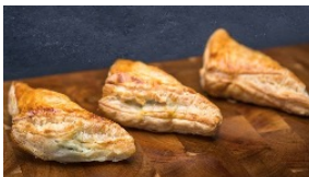
SPINACH FETA EMPANADA $11.50 (dozen)