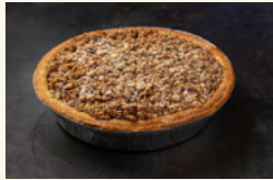
DUTCH APPLE CRUMB PIE $12.45 (each)