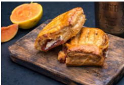
REFUGIADO®- GUAYA & CHEESE STRUDEL $11.75 (dozen)