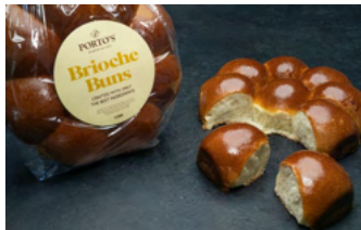
BRIOCHE BUNS $2.95 (Pack of 9)