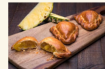
PINEAPPLE EMPANADA $1.35 (each)