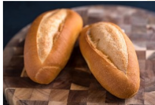
FRENCH ROLL $3.25 (Pack of 6)