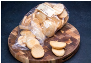
CUBAN CRACKERS BAG $2.50 (each)