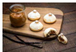
DULCE DE LECHE BESITO™ COOKIES $8.55 (dozen)