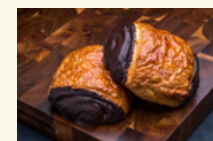
CHOCOLATE CROISSANT $2.05 (each)