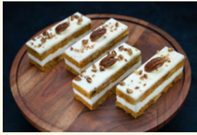
CARROT CAKE SLICE $3.35 (each)