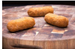
HAM CROQUETTE $11.45 (dozen)