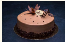
PARISIAN CHOCOLATE CAKE 9" $28.00 (each)