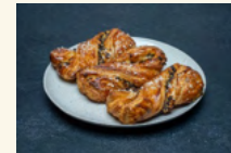
CHOCOLATE TWIST $2.05 (each)