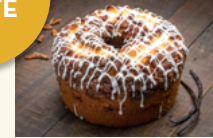
CINNAMON COFFEE CAKE $8.25 (each) Multi-serve