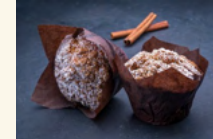
PUMPKIN MUFFIN $1.95 (each)