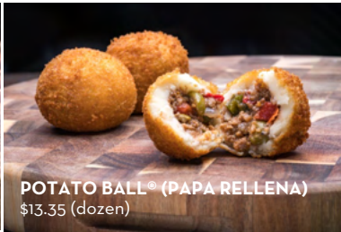
POTATO BALL® (PAPA RELLENA) $13.35 (dozen)