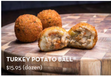
TURKEY POTATO BALL® $15.95 (dozen)