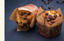
CHOCOLATE CHIP MUFFIN $1.95 (each)