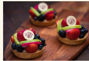
FRESH FRUIT TARTLET $3.95 (each)