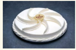
TRES LECHEs CAKE 10" $22.50 (each)