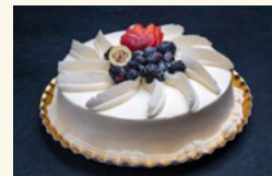
MILK'N BERRIES™ CAKE 8" $33.50 (each)