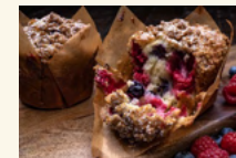
MIXED BERRY MUFFIN $1.95 (each)