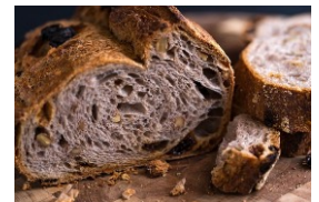
WALNUT RAISIN BATARD $3.35 (each)