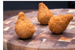
CHICKEN CROQUETTE $13.35 (dozen)