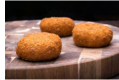
CHEESE & SPICY PEPPERS POTATO BALL® $15.95 (dozen)