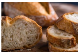
SOURDOUGH BATARD $3.35 (each)