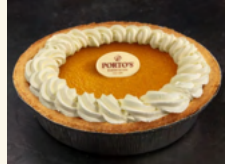
PUMPKIN PIE 9" $12.45 (each)