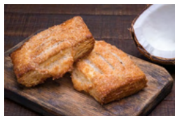
COCONUT STRUDEL $16.20 (dozen)