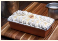
TRES LECHEs CAKE BOX $9.25 (each)