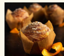
CINNAMON CITRUS BUN $1.95 (each)