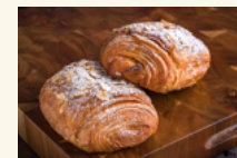
ALMOND CROISSANT $1.95 (each)