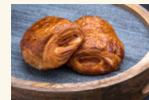
BAKED HAM & CHEESE CROISSANT $2.55 (each)