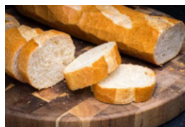
FRENCH BAGUETTE $1.95 (each)