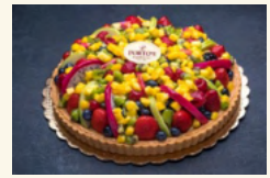
FRESH FRUIT TART 11" $28.25 (each)