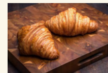
BUTTER CROISSANT $1.85 (each)