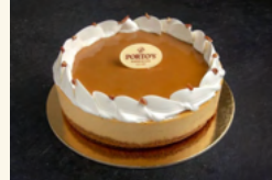
PUMPKIN CHEESECAKE $27.00 (each)