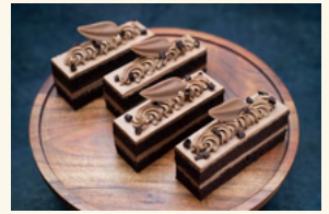
PARISIAN CAKE SLICE $3.35 (each)