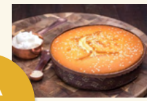
QUESADILLA $3.85 (each) Multi-serve