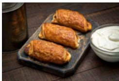
CHEESE ROLL® $10.65 (dozen)