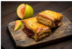
GUAYA STRUDEL (PASTEL DE GUAYABA) $10.95 (dozen)